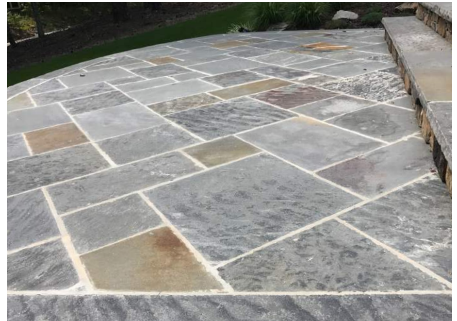
CUT TO JOB