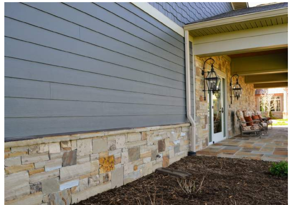
3" x 18" x 2 1/4" PITCHED & 3" x RANDOM LENGTHS x 2"- 3"