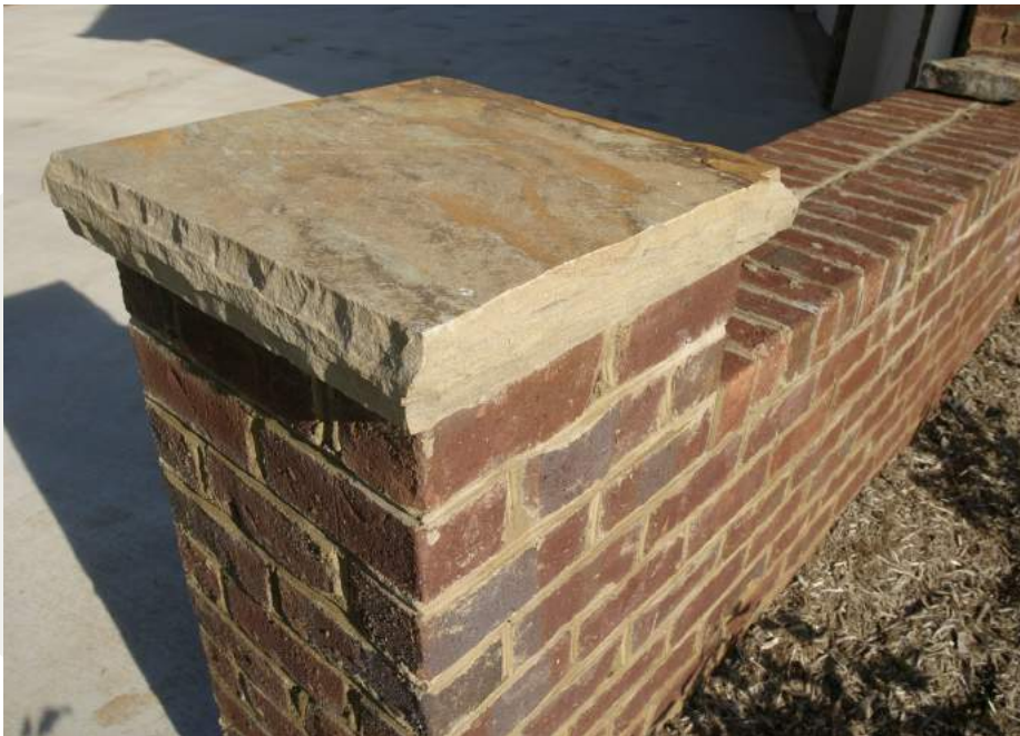
CUT TO JOB