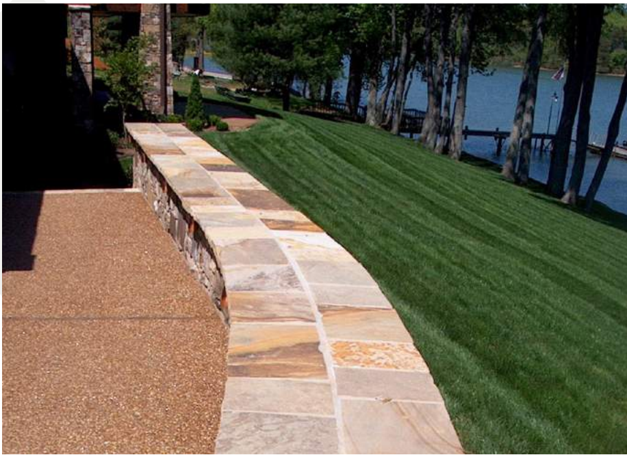
12" WIDE x RANDOM LENGTHS x 2"- 3" IN