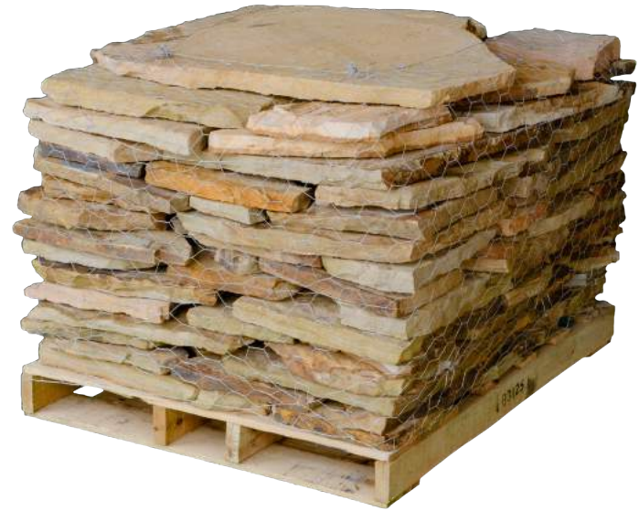
FLAGSTONE 1"- 2" BROWN