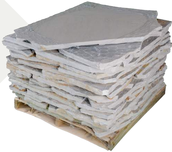
FLAGSTONE 1"- 2" GREY