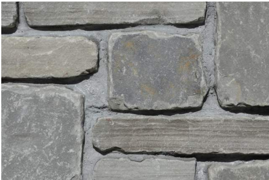
RUSTIC BUFF GREY™