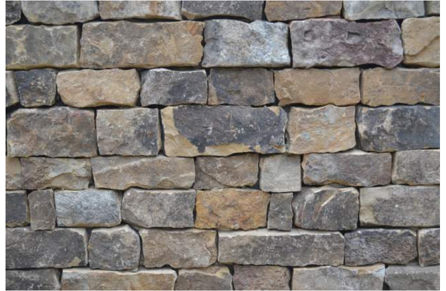
WEATHERED LEDGE™ 3" TO 6"