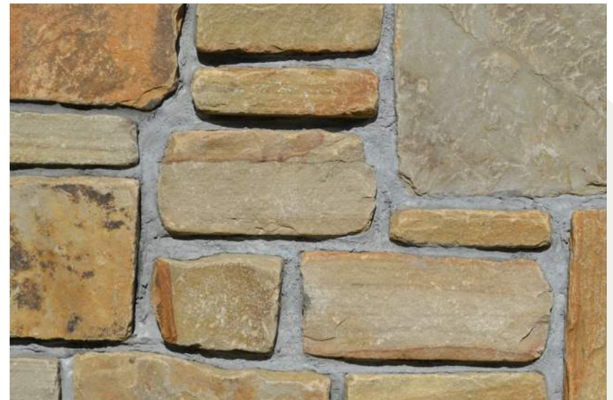
RUSTIC BUFF BROWN™