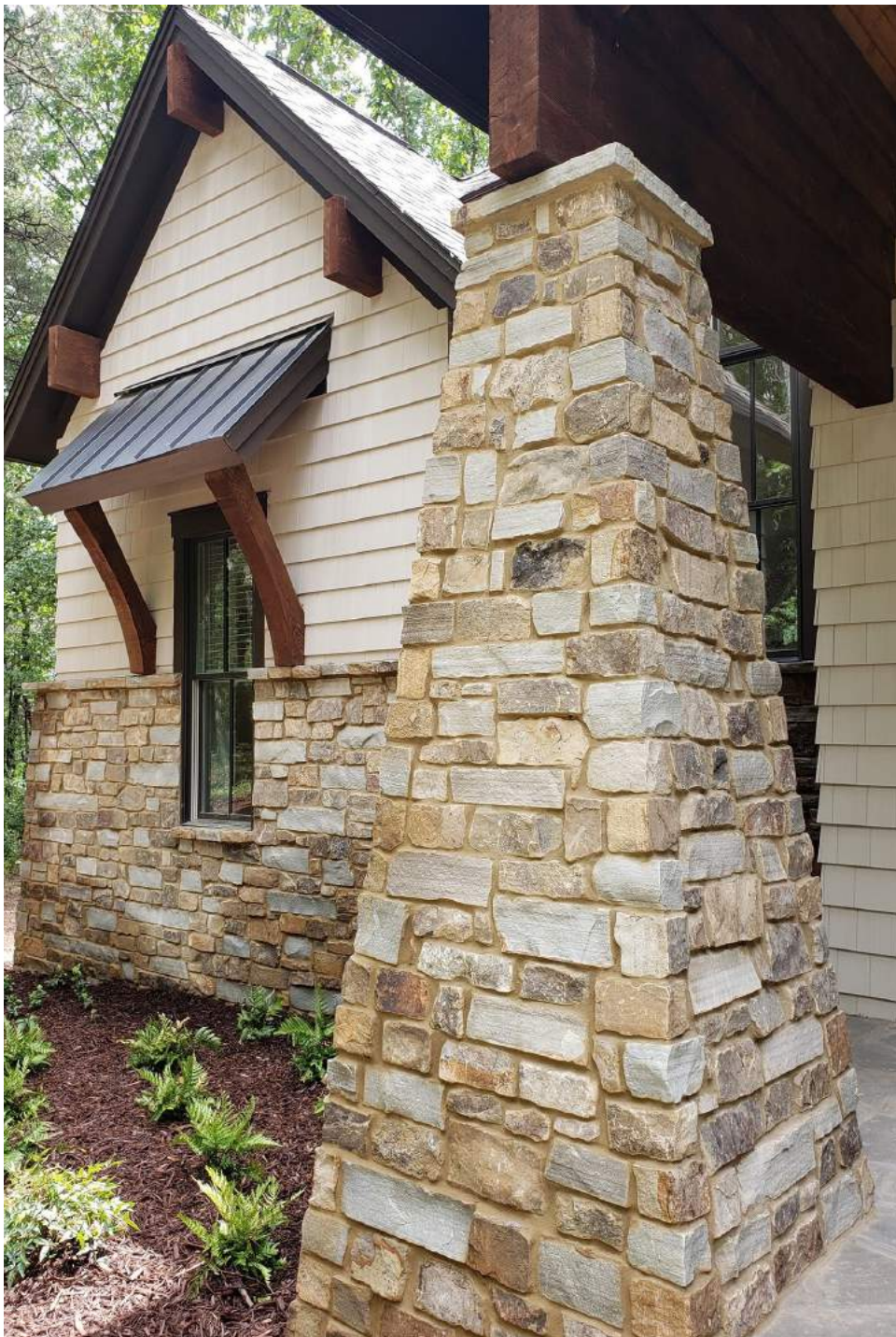
LB GREY 50% WEATHERED LEDGE 50%