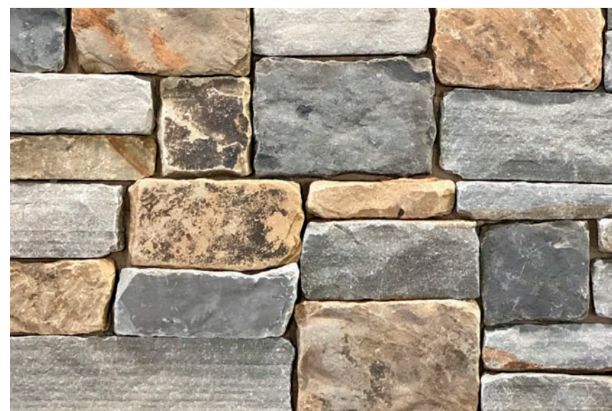
RUSTIC BUFF BLEND™