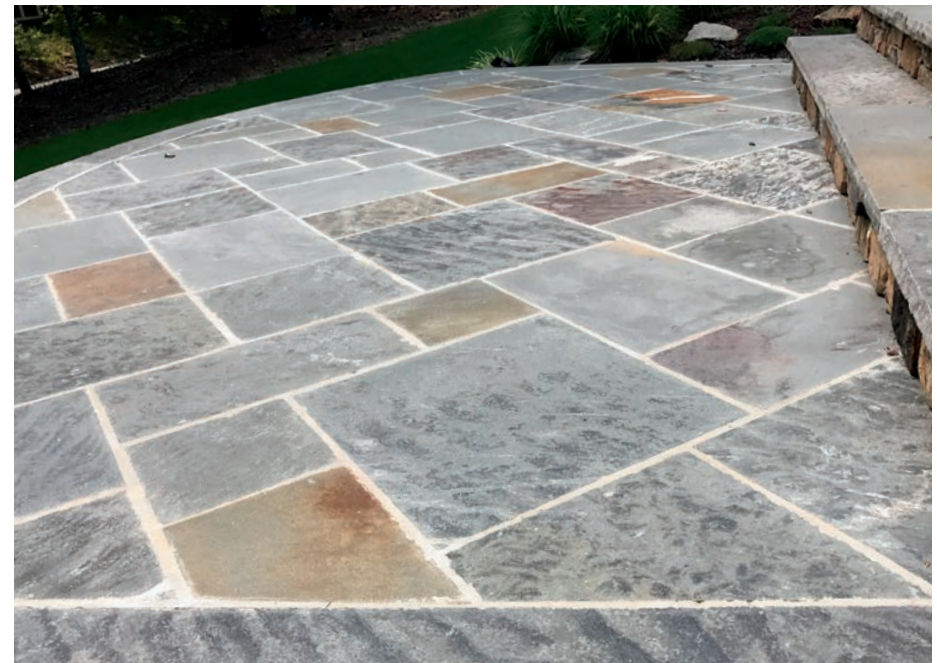
CUT TO JOB FLOORING