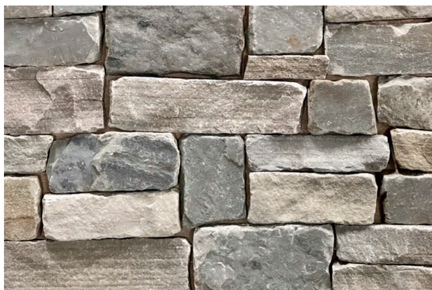
RUSTIC BUFF GREY™