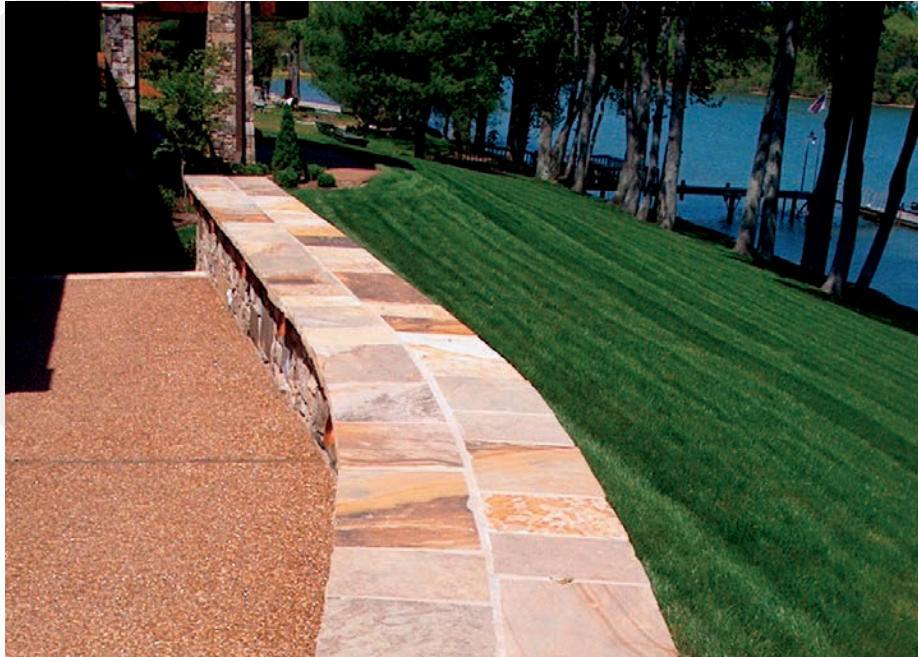
12" WIDE x RANDOM LENGTHS x 2"- 3" IN WALL CAP