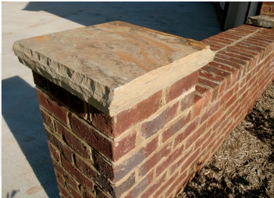
CUT TO JOB COLUMN CAP