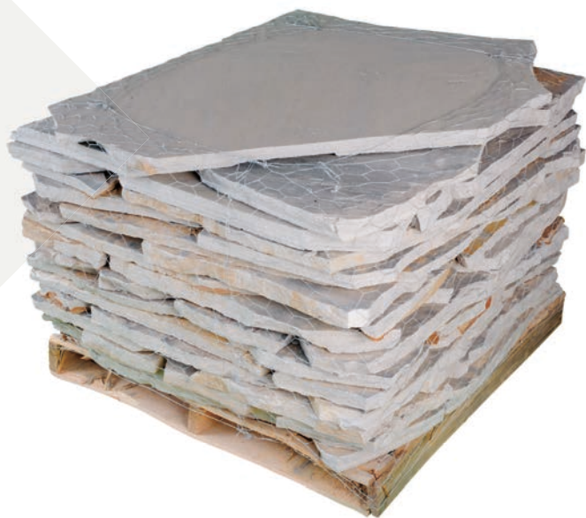
FLAGSTONE 1"- 2" GREY