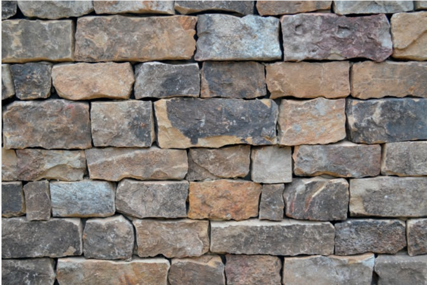
WEATHERED LEDGE™ 3" TO 6"