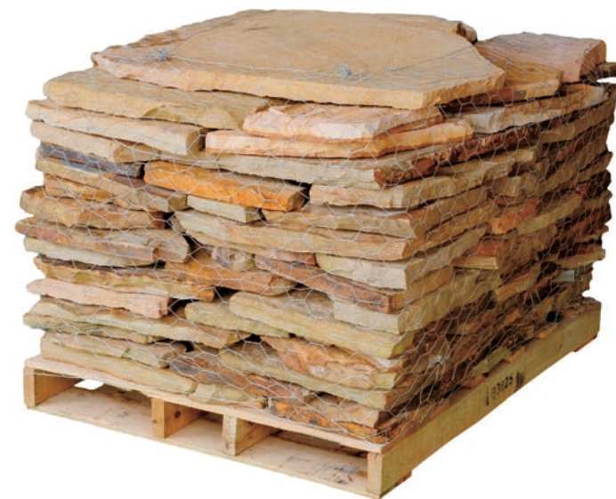
FLAGSTONE 1"- 2" BROWN