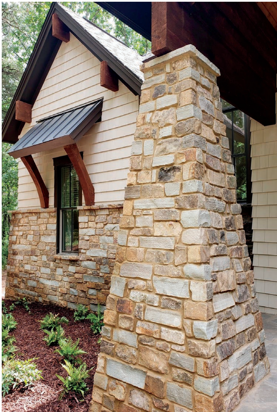
LB GREY 50% WEATHERED LEDGE 50%