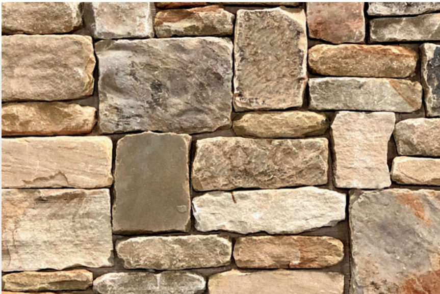
RUSTIC BUFF BROWN™