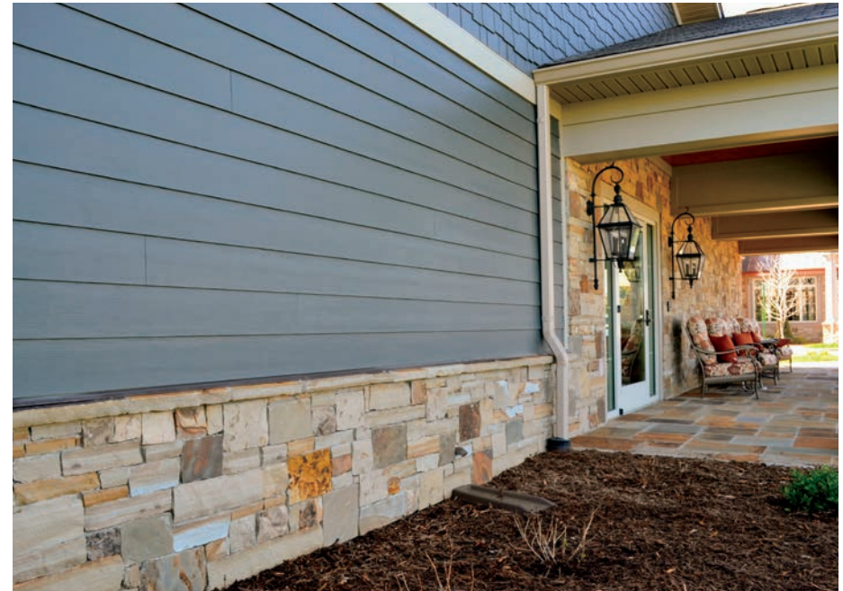
3" x 18" x 2 1/4" PITCHED & 3" x RANDOM LENGTHS x 2"- 3" WATER TABLE SILLS